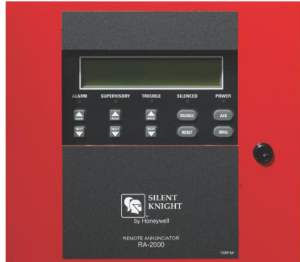
ECS-RPU shown with an RA-2000